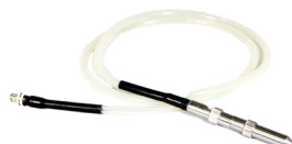
Getinge Assured Wash Monitor Holder Flexible