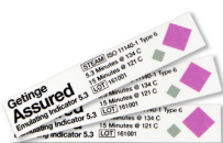
Getinge Assured Emulating Indicators