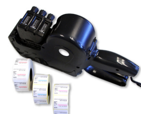
Getinge Assured Record Labels for Steam, EO & VHP