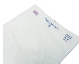
Pouch made of Tyvek®