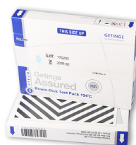
Getinge Assured Bowie-Dick Test Pack 121°C & 134°C*