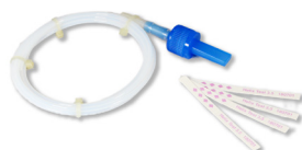
Getinge Assured Helix Test 3.5, 4, 5.3, 7 & Formaldehyde