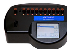
Getinge Assured Smart-Well Incubator with Printer