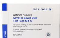
Getinge Assured AdvaTec Bowie-Dick Test Pack 134°C*

With highly sensitive advanced ink, our technology provides greater accuracy and user information on process conditions compared to conventional test packs.