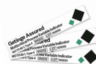
Getinge Assured Multicritical Process Variable Indicator (VH 2 O 2 )