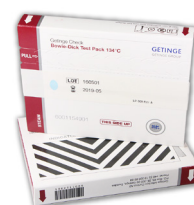
Getinge Check Bowie-Dick Test Pack 134°C**