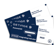
Getinge Assured MI Steam Migrating Integrator Strip