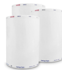
Roll made of Tyvek®

DuPont™ and Tyvek® are trademarks or registered trademarks of E.I. du Pont de Nemours and Company.