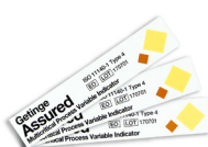
Getinge Assured Multicritical Process Variable Indicator (EO)