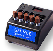
Getinge Assured Multi Incubator