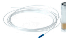
Getinge Assured Protein Test Flexible Endoscope 2,5 m