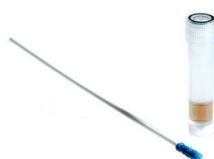
Getinge Assured Protein Test Instrument Lumen