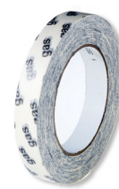
Getinge Assured Ethylene Oxide Tape 18mm & 24mm