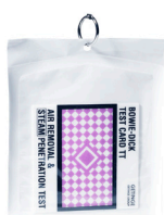
Getinge Assured Bowie-Dick Test Card TT