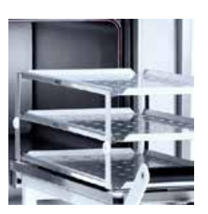
Set of shelves used for loading of containers (STU) and individual packs directly on the shelves.