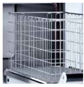
Loading of modular wire baskets, using the perforated tray with rollers. For one wire basket 590 \times 300 \times 90 mm, 2-3 baskets 590 \times 300 \times 100 mm, or a combination.