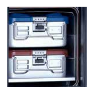
Containers on tray in fixed aluminum rack.